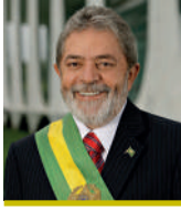
H.E. Mr. Luiz Inácio Lula da Silva

Former President of Brazil (Guest of Honor)