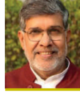
Mr. Kailash Satyarthi

Winner of the Nobel Prize in Peace in 2014